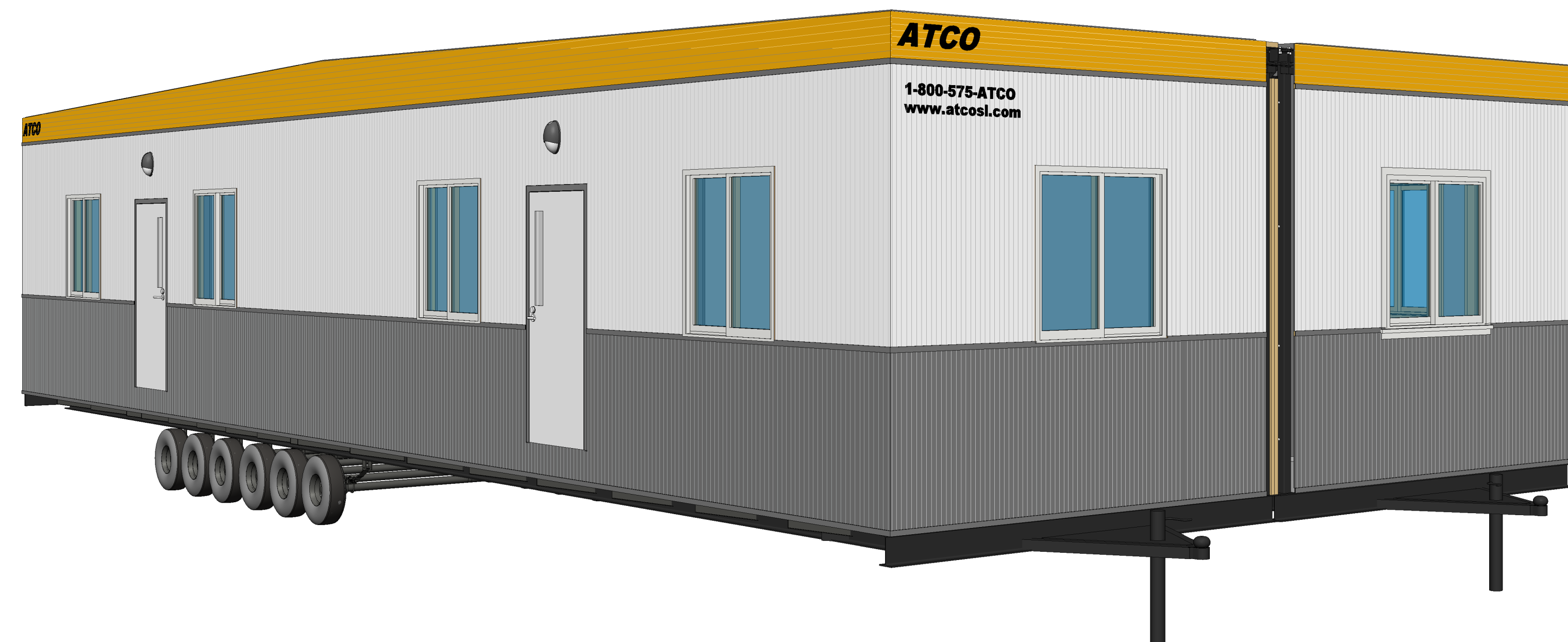
2 3D - ISOMETRIC

3D RENDERINGS ARE GRAPHICAL REPRESENTATIONS ONLY - ITEMS & MATERIALS MAY NOT BE EXACTLY AS SHOWN