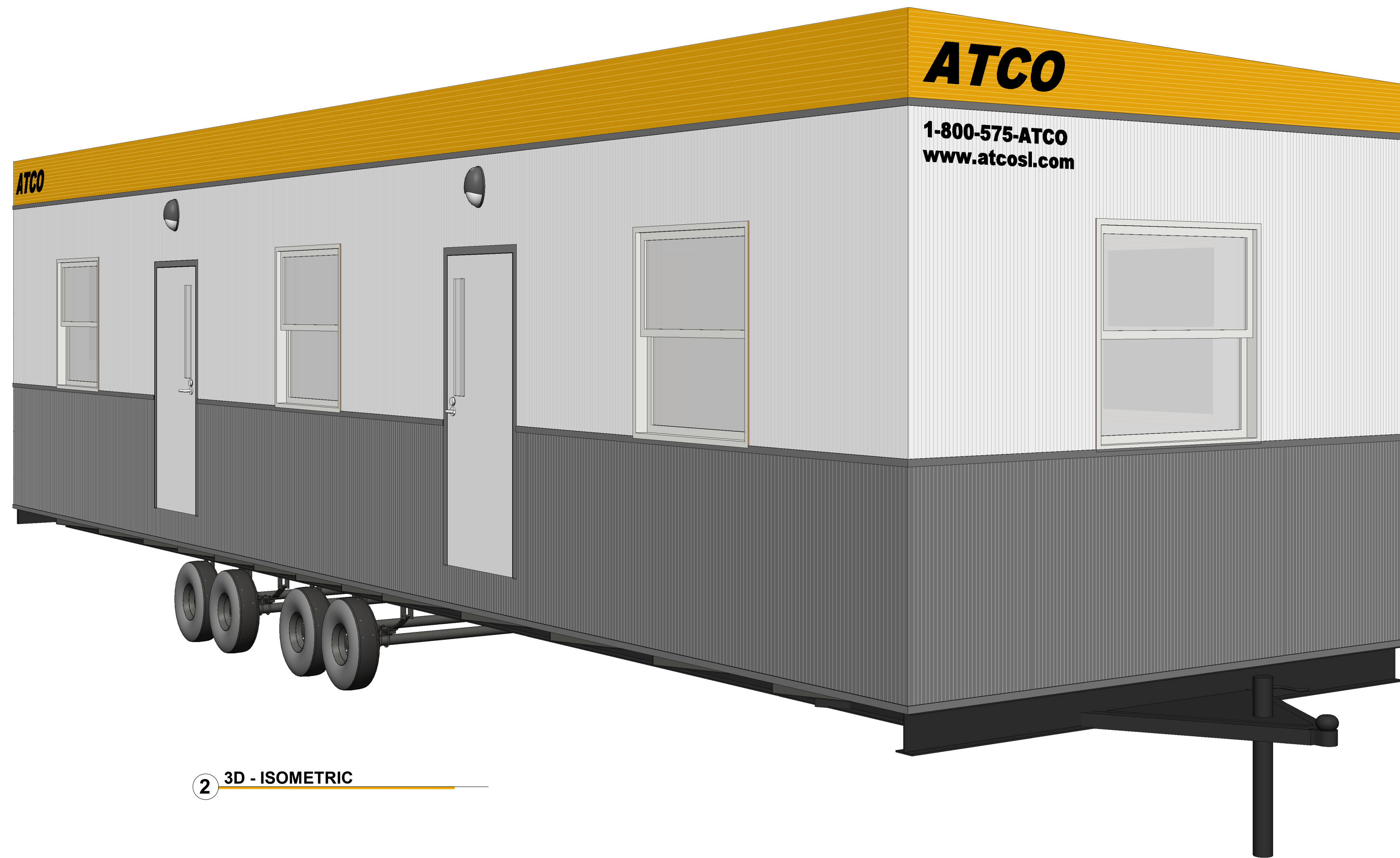
2 3D - ISOMETRIC