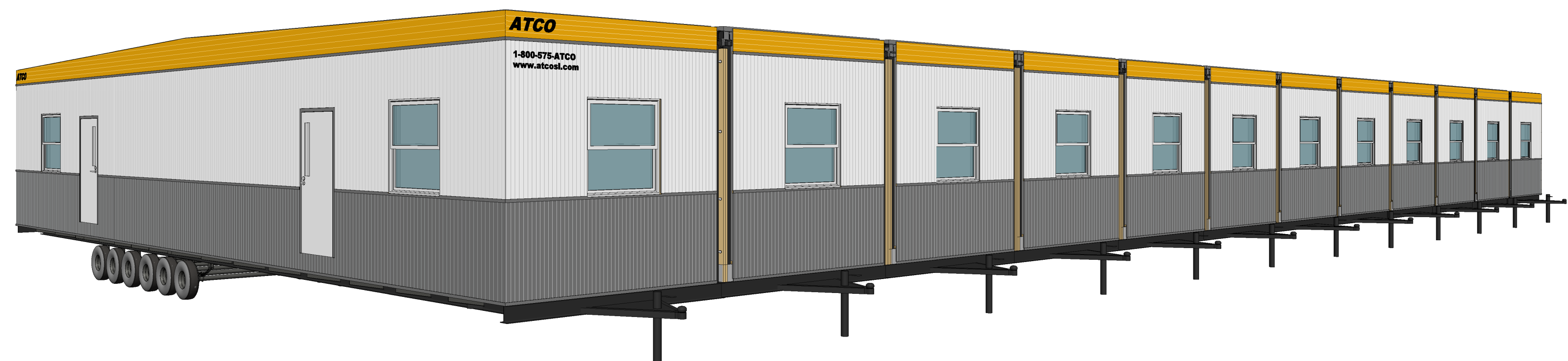
2 3D - PERSPECTIVE

3D RENDERINGS ARE GRAPHICAL REPRESENTATIONS ONLY - ITEMS & MATERIALS MAY NOT BE EXACTLY AS SHOWN