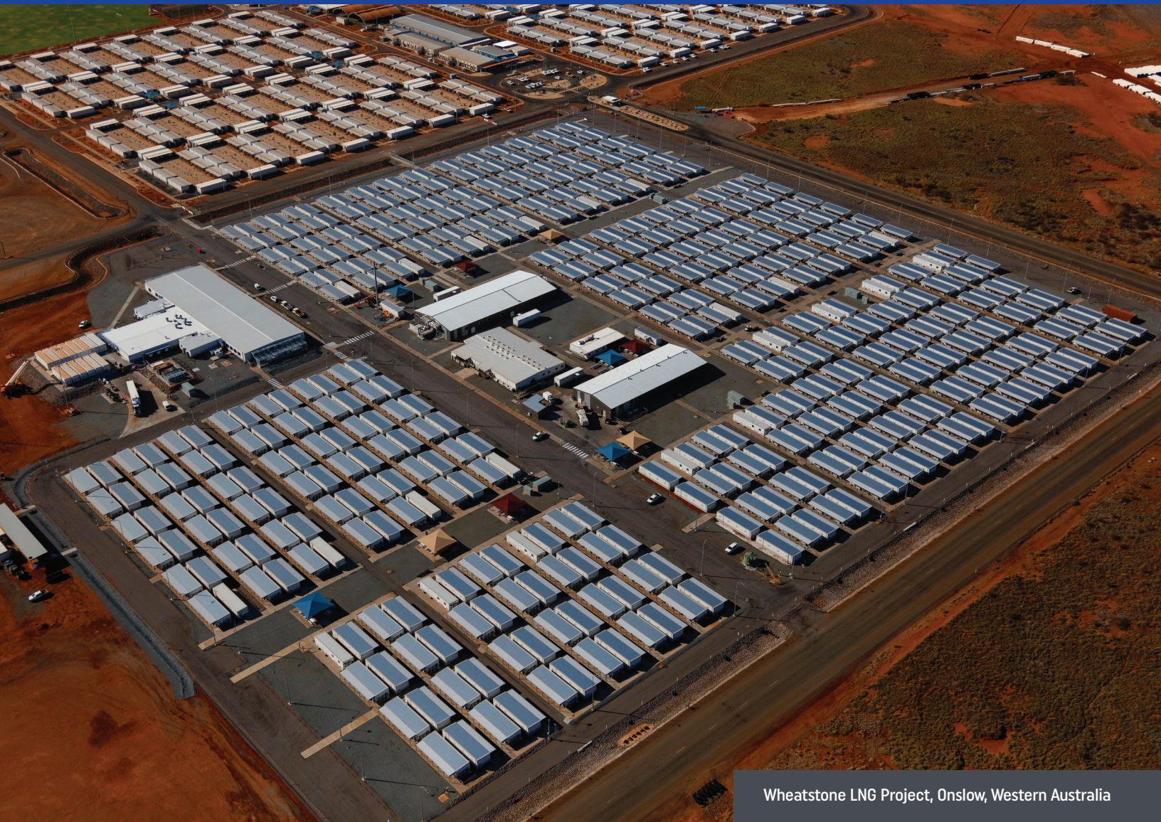
Wheatstone LNG Project, Onslow, Western Australia

ATCO Structures has extensive global experience constructing large and challenging camps across the globe. With over 75 years' experience with oil and gas projects, we have constructed LNG specific camps in some of the most remote locations and extreme climates in the world. We offer a reliable turnkey solution that includes: