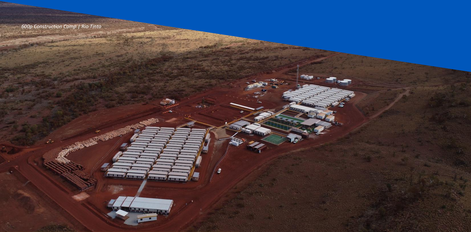
600p Construction Camp | Rio Tinto

Our buildings can be fit with electrical and plumbing connections to allow quick connection on site, without compromising quality.