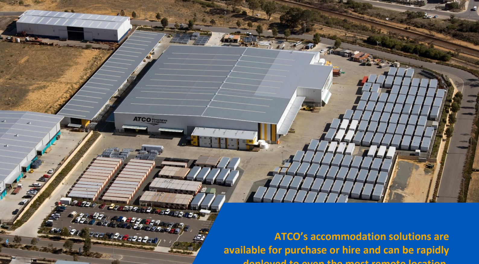
Hope Valley, Perth | Manufacturing Facility

ATCO's accommodation solutions are available for purchase or hire and can be rapidly deployed to even the most remote location.