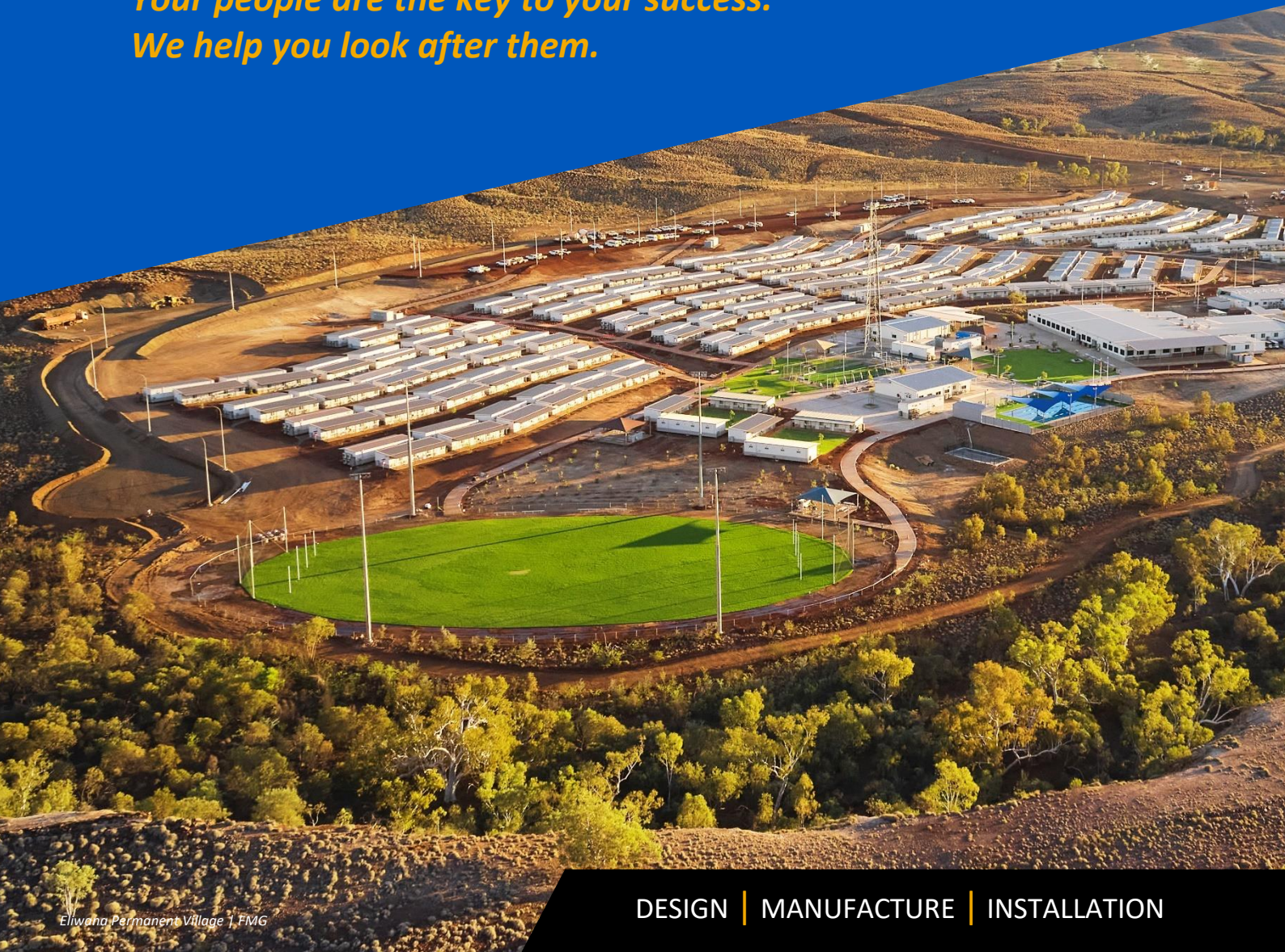
Eliwana Permanent Village | FMG

Your people are the key to your success. We help you look after them.