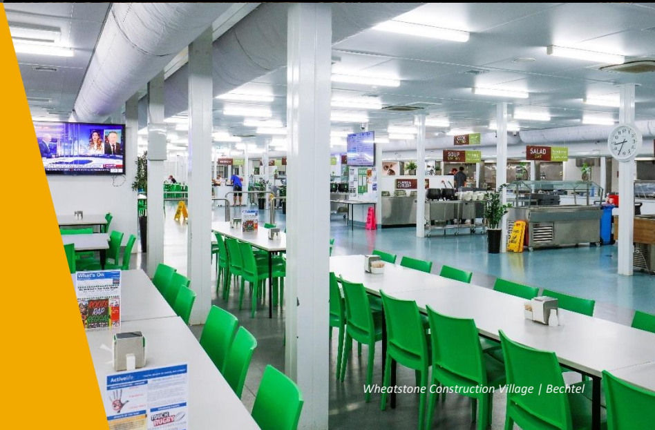
Wheatstone Construction Village | Bechtel