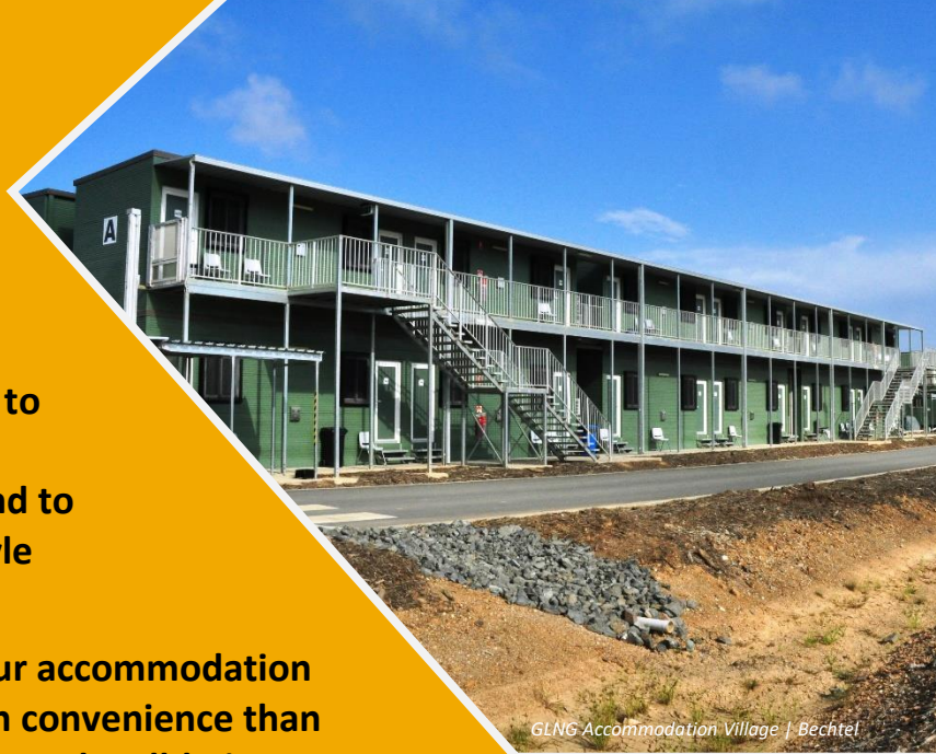
GLNG Accommodation Village | Bechtel

Water and waste services, swimming pools, village lighting, car parks, and landscaping are village components that we can provide, delivering a complete turnkey village solution.