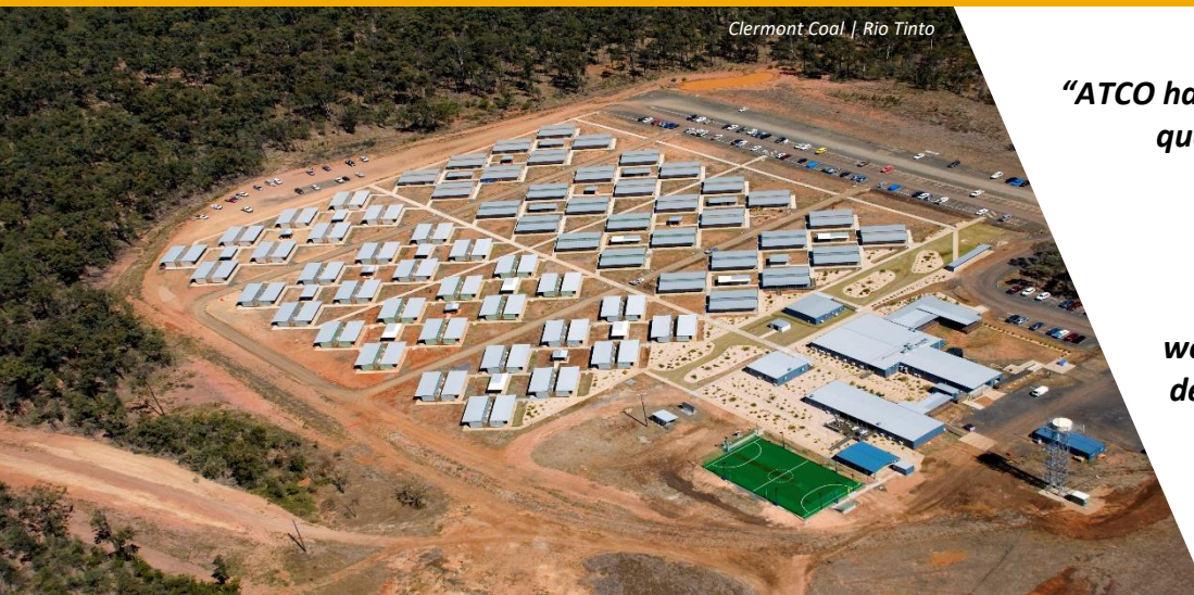
Clermont Coal | Rio Tinto

“ATCO has consistently delivered high quality facilities on time, safely meeting our increasingly challenging schedule needs. The professionalism and commitment of ATCO’s workforce to successfully meet demanding project milestones ... is exemplary.