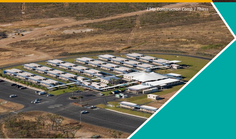
194p Construction Camp | Thiess

ATCO's versatile, durable modular buildings for hire include: