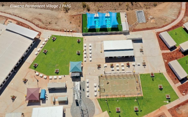
Eliwana Permanent Village | FMG

CUSTOM SOLUTIONS | FASTER BUILD | SUPERIOR QUALITY