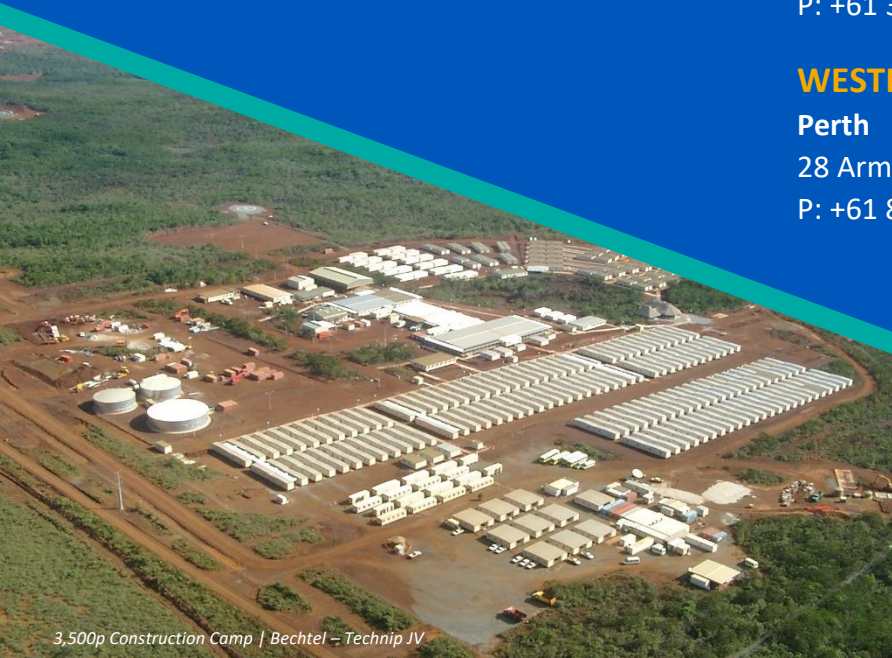
3,500p Construction Camp | Bechtel – Technip JV