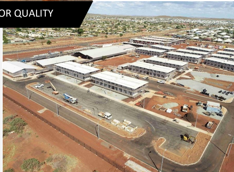
Bay Village | Multiplex