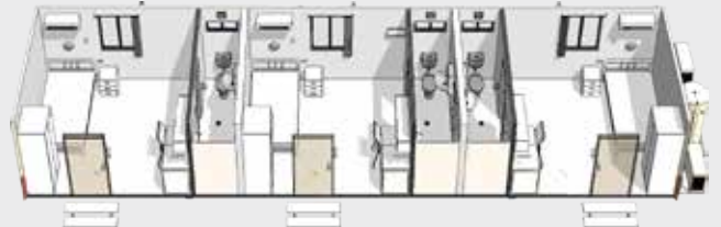
WOF-511 12.0m x 6.0m Site Office