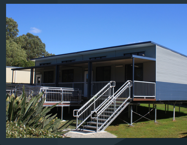
St Andrews Anglican College, QLD

Our experienced Design and Project Management teams enables us to support our customers through each phase of development, from initial feasibility through to detailed design, documentation, construction management, commissioning and handover to offer a full turn key solution.